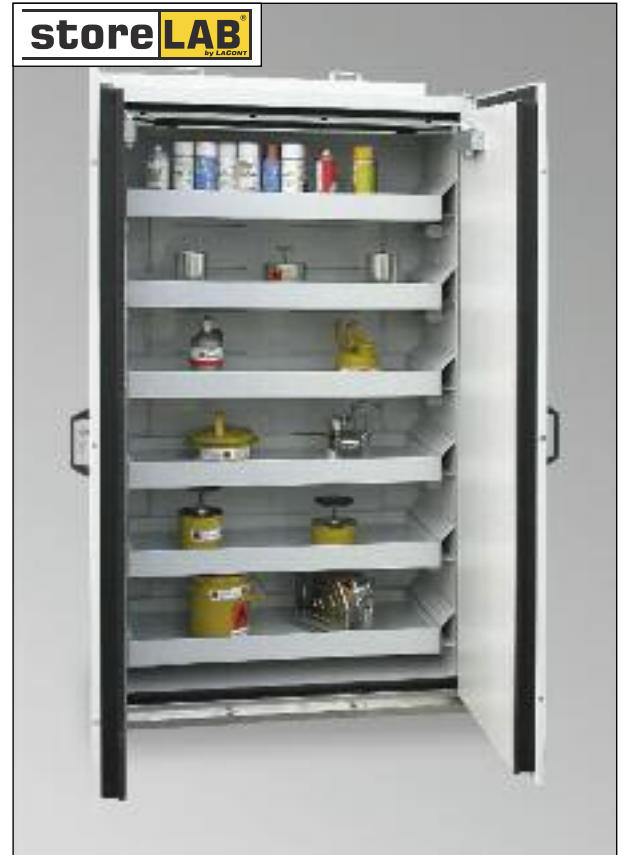
SiS Type 90 / 1200 VS6, Art.-No. B80-2534-B, RAL 7035, incl. 6 pull-out shelves