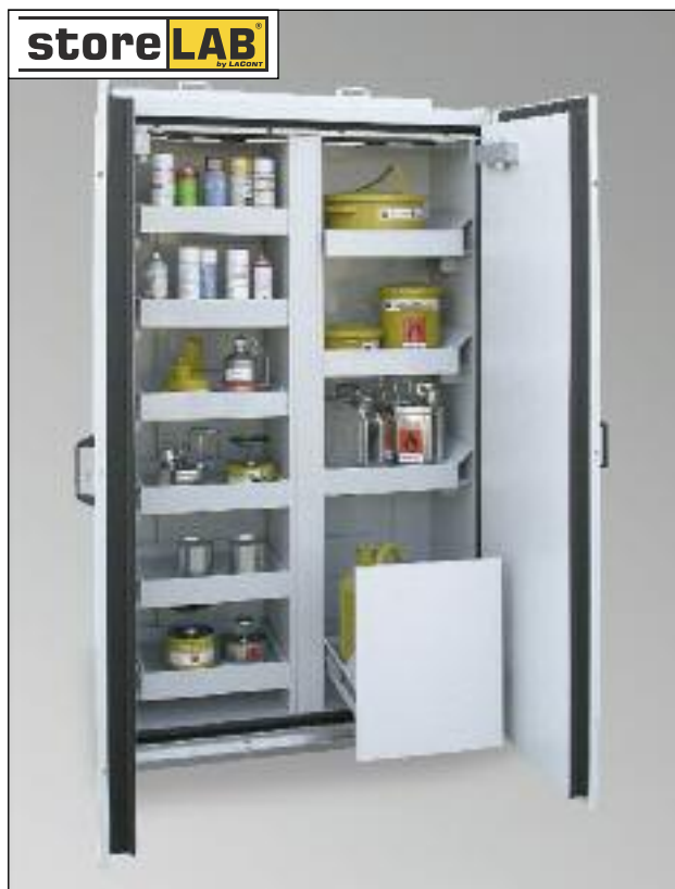
SIS Type 90 / 1200 ES MI, Art.-No. B80-2556-B, RAL 7035, incl. 6 pull-out shelves (left) and 3 pull-out shelves + 1 disposal compartment (right)