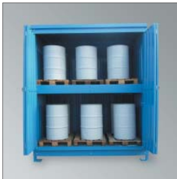
QGC 2-28, Article No. R26-3200-A