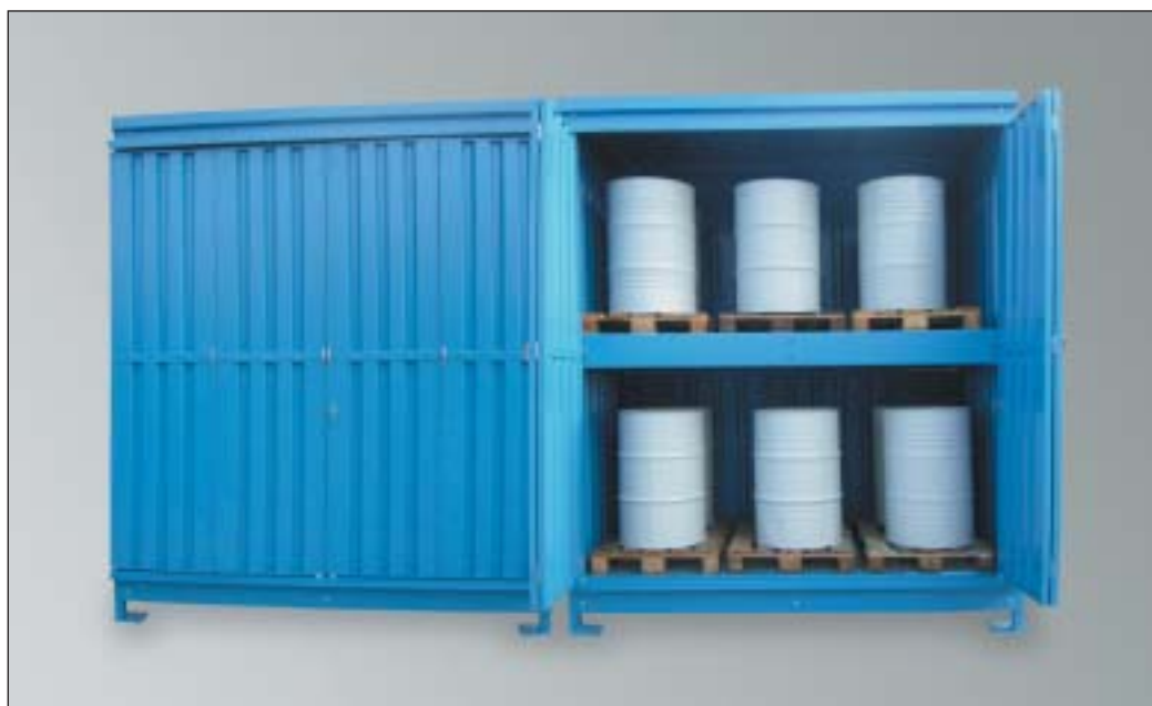
QGC 2-56, Article No. R26-3201-A