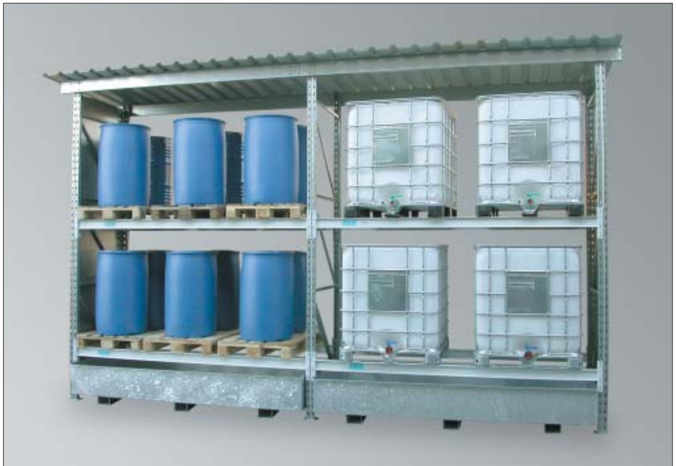
FPR-W-2736, basic unit, Art. No. R26-3100-C and extension unit, Art. No. R26-3110-C, with sidewalls, Art. No. R26-3115-C