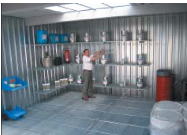
Equipped with shelving and skylight panel in roof (on request)