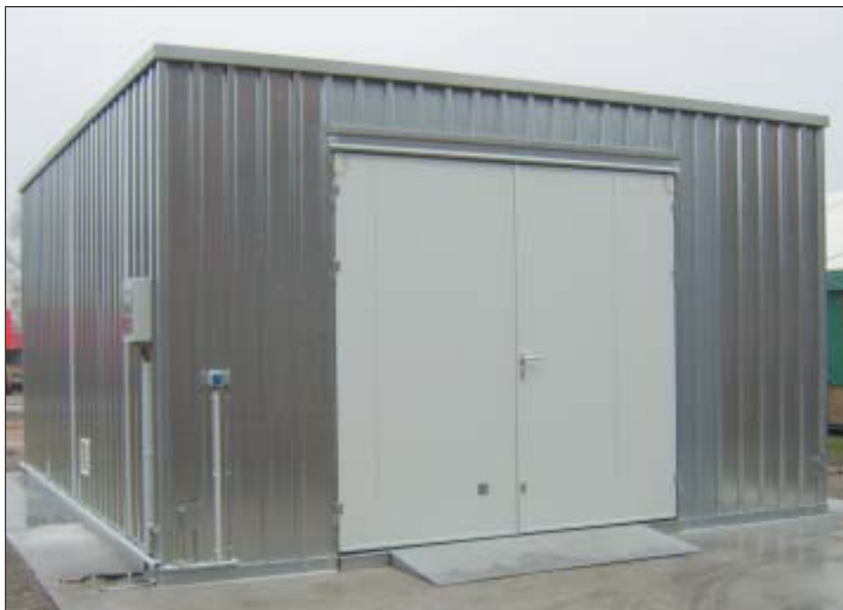
Water protection storage hall, special version with thermal insulation