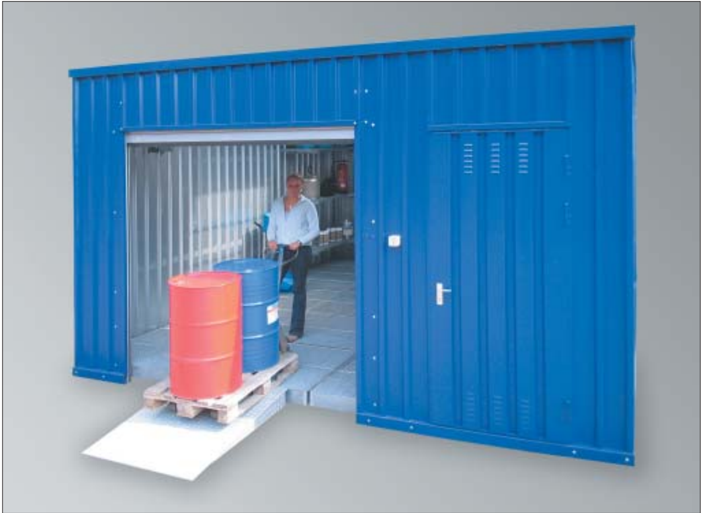
WS-LH 5 x 6, Article No. H62-1210-B, with optional shelving, drive-on ramp and additional outer lacquering