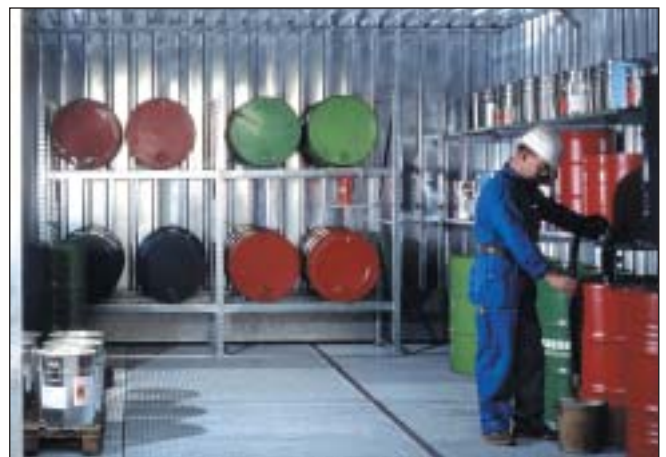
Equipped with shelving for use as small container store