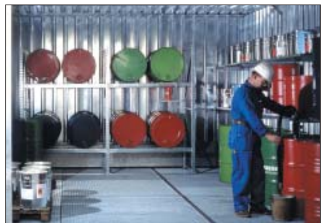
Equipped with shelving for use as small container store