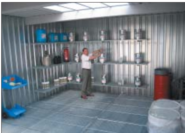
Equipped with shelving and skylight panel in roof (on request)