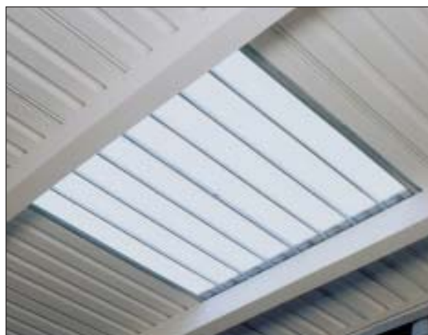
Skylight panel 2 x 2 m in roof, price on request