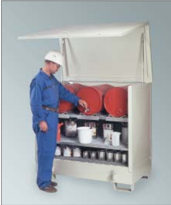
2GSKS, with shelving as special equipment