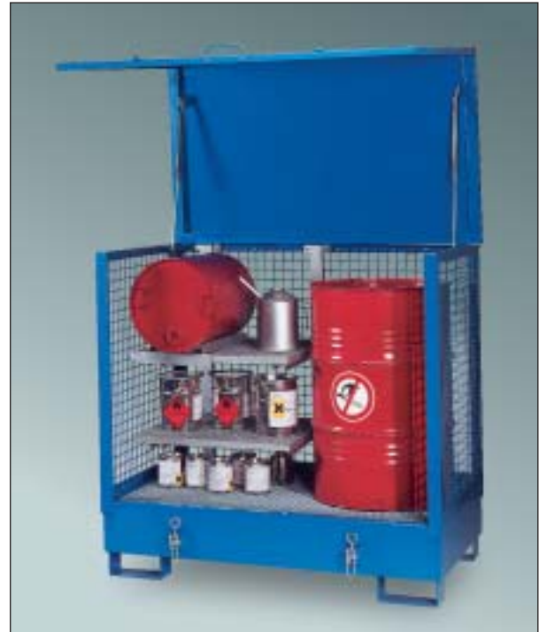
2GSKS, with shelving as special equipment