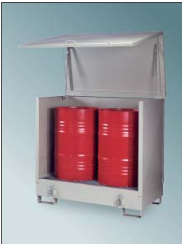
2GSKS, Article No. P21-2503-A