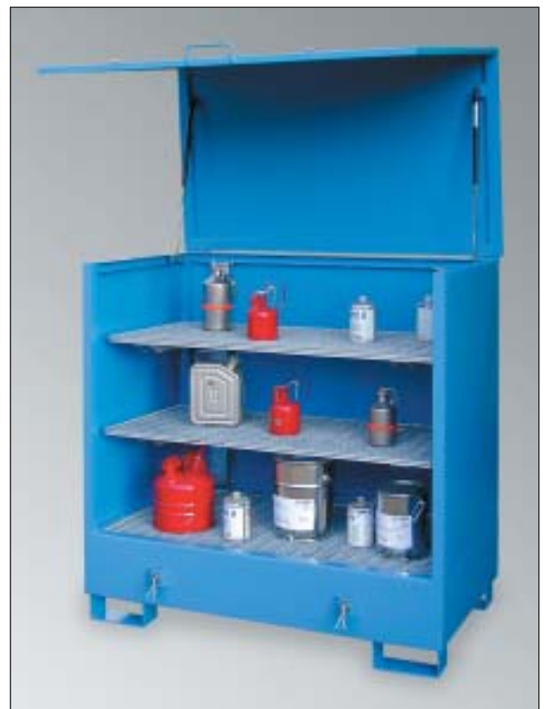
2GSKS, with shelving as special equipment