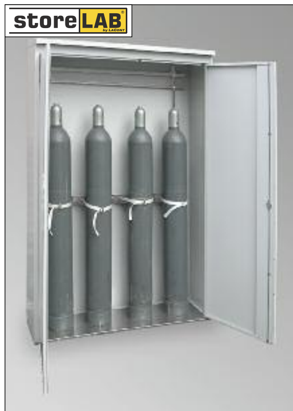
TRG 1400, Art.-No. C27-3301-B