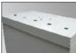
View of roof with prepared tubing lead-throughs and exhaust connection