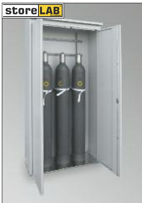
TRG 1050, Art.-No. C27-3302-B