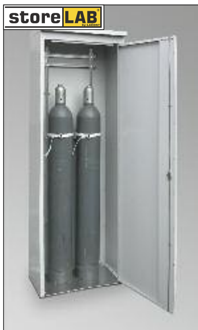
TRG 700, Art.-No. C27-3300-B