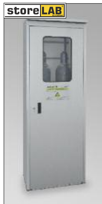
TRG-cabinets with optional acrylic glass window