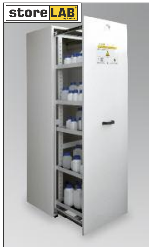
CHS-APO 600, Art.-No. B80-6226-A