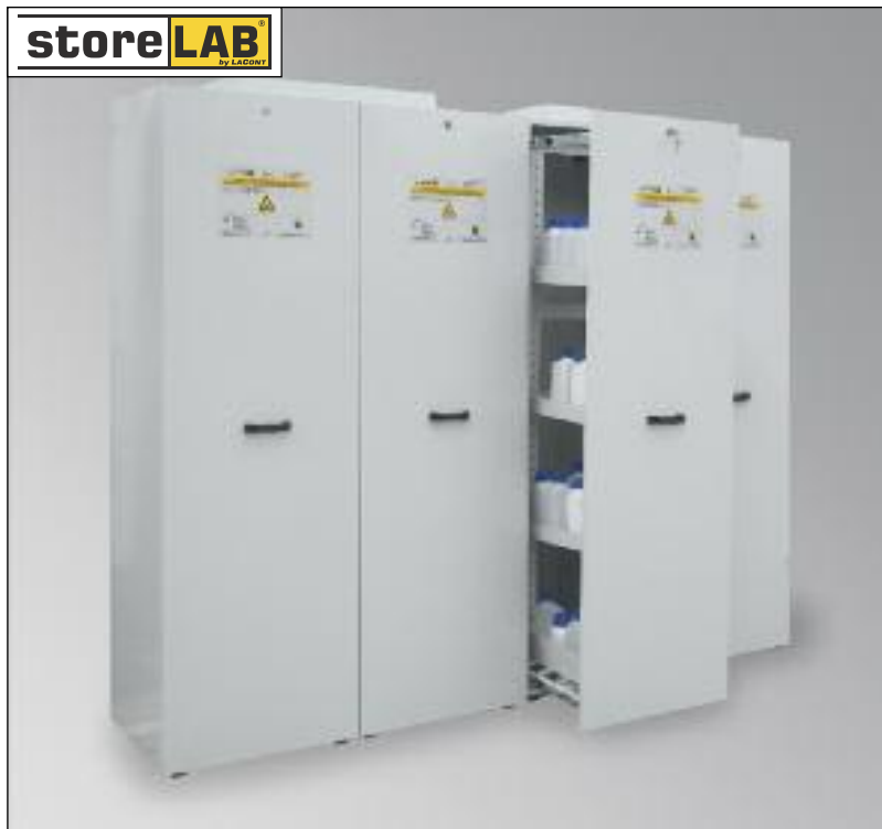
CHS-APO 2400, Art.-No. B80-6229-A