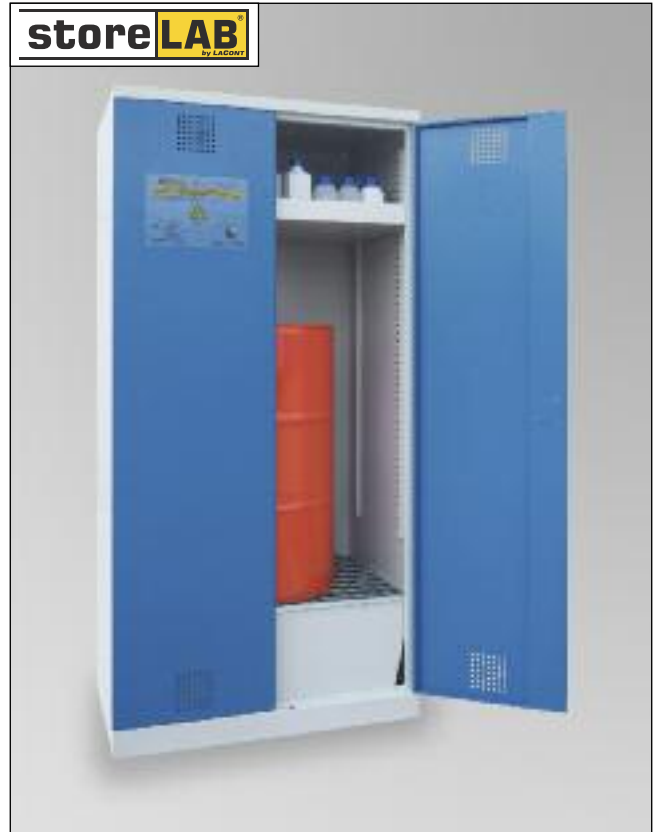
CHS-1FAS 950-660, Art.-No. B80-6245-A