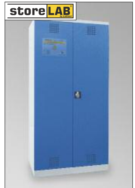
CHS-1FAS 950-660, Art.-No. B80-6245-A