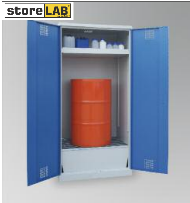
CHS-1FAS 950-660, Art.-No. B80-6245-A