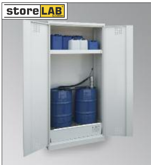
CHS-2FAS 950, Art.-No. B80-6225-A