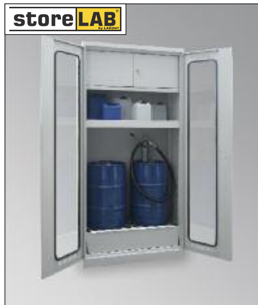
CHS-2FAS 950 GL, Art.-No. B80-6239-A, with optional safe compartment