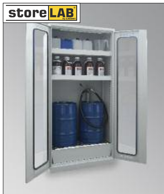
CHS-2FAS 950 GL, Art.-No. B80-6239-A, with additional trough-shaped shelf