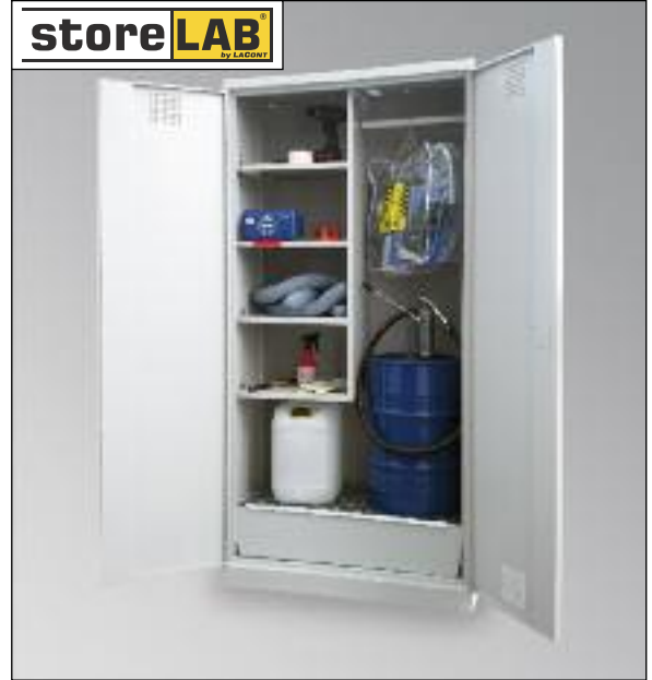
CHS-1FAS 950, Art.-No. B80-6241-A