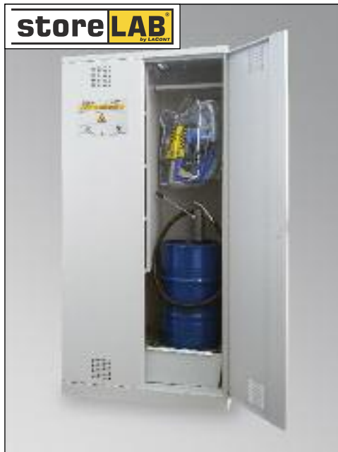
CHS-1FAS 950, Art.-No. B80-6241-A