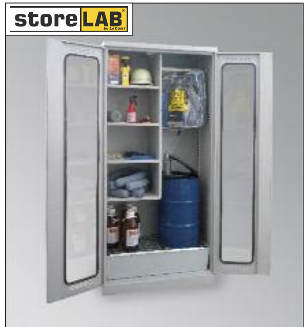
CHS-1FAS 950 GL, Art.-No. B80-6242-A