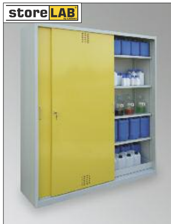
CHS 1800, Art.-No. B80-6219-A