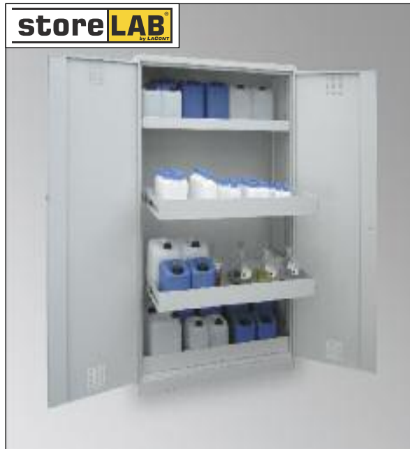
CHS 950 VS, Art.-No. B80-6217-A