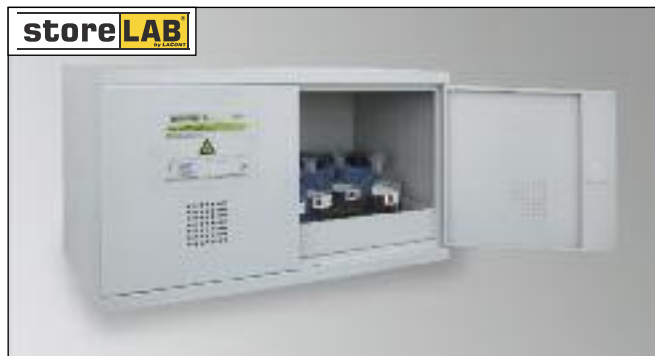
CHS-AUS 1100, Art.-No. B80-6220-A