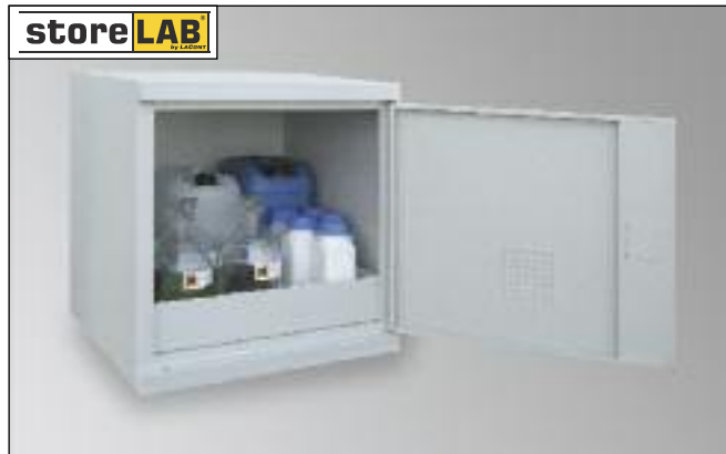
CHS-AUS 600, Art.-No. B80-6223-A