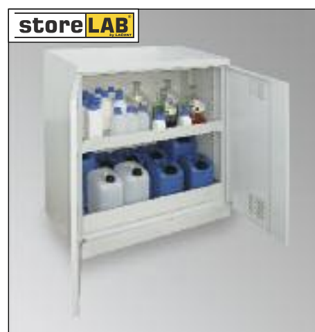
CHS 950-1000, Art.-No. B80-6122-A