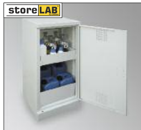
CHS 500-1000, Art.-No. B80-6120-A