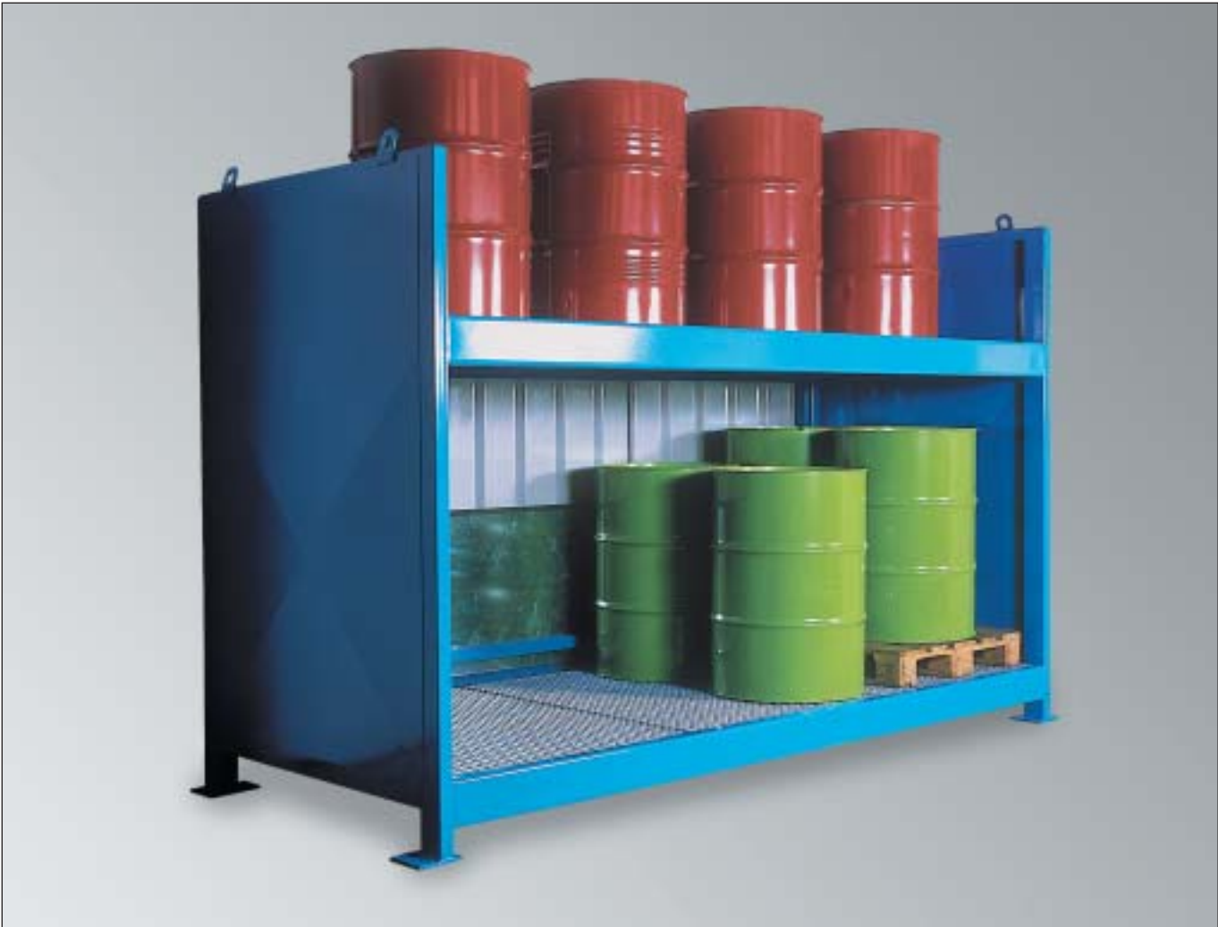
WSC-G-E.2-30, Article No. C22-5502-B