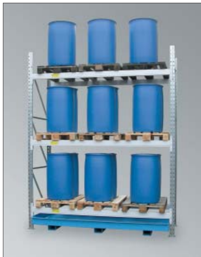
G-PR 3.27/660, basic unit