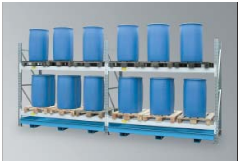
G-PR 2.27/360, basic and extension units