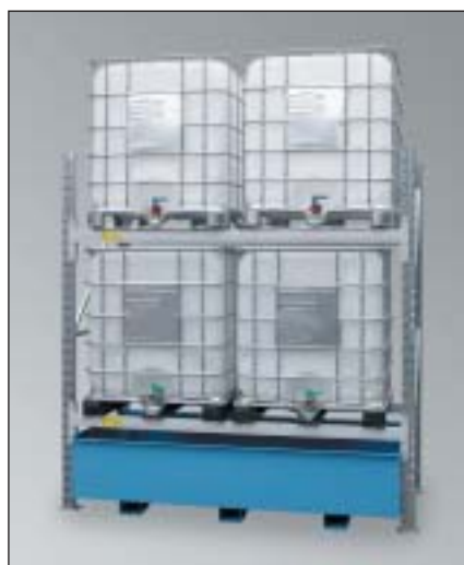
G-KR 2.22/1000, basic unit

By the additional use of support grids it is also possible to store various KTCs and large containers!