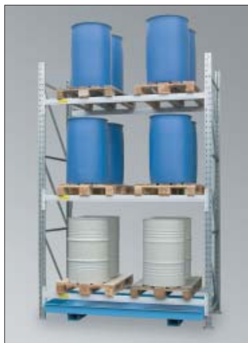
G-PR 3.22/360, basic unit

For the storage of hazardous substances as barrelled goods on Euro or chemical pallets on 3 storage levels