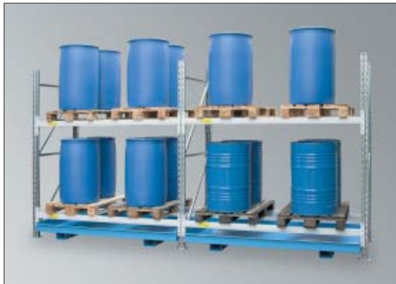
G-PR 2.22/360, basic and extension units