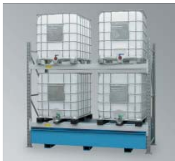
G-KR 2.27/1000, basic unit