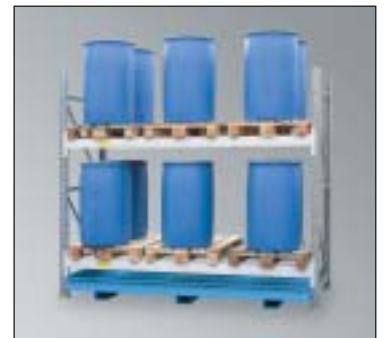
G-PR 2.27/360, basic unit