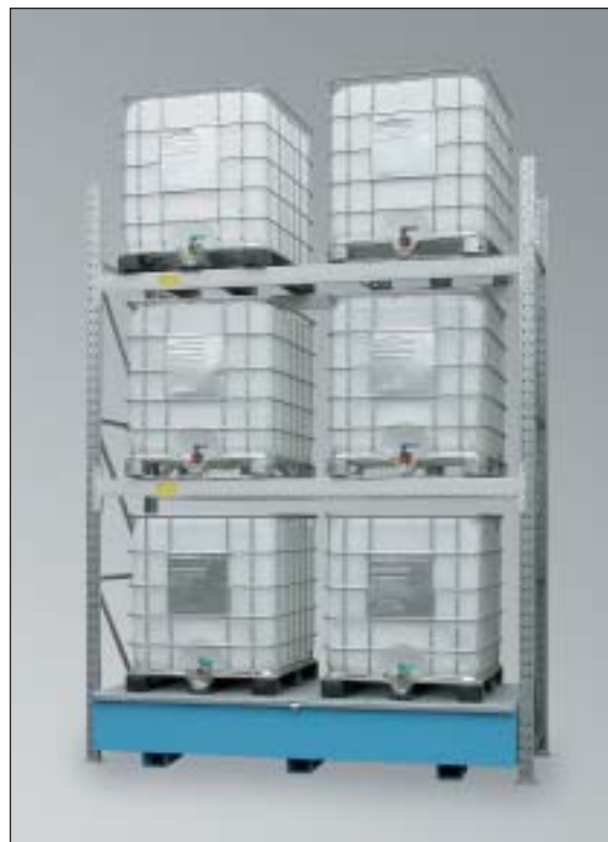
G-KR 3.27/1000, basic unit