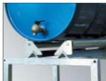
Rotating drum support, Article No. Z50-1925-A