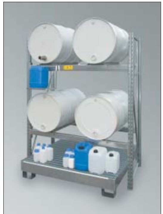
FR2-2222, Article No. R74-1007-A, with optional can support