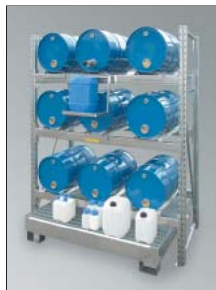
FR3-96, Art. No. R74-1023-A, with optional can support