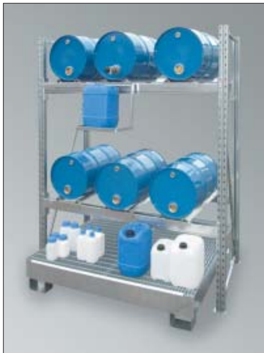
FR2-3636, Article No. R74-1015-A, with optional can support