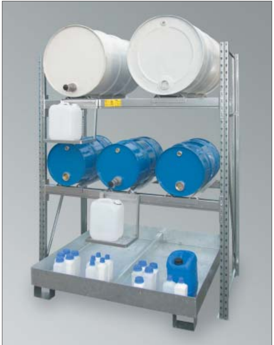
FR2-2236, Article No. R74-1010-A, with optional can support