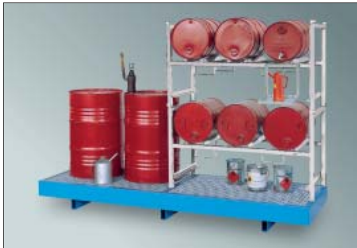
WSP-4L-OS with 2 x STR-3 stacking racks and can support

Placing a 200 litre drum horizontally in the top storage level is easier said than done. Using the fork tips of a fork-lift truck an environmental risk is too great and is therefore forbidden. The stacking rack is an officially approved solution that meets the practical requirements of day-to-day work.