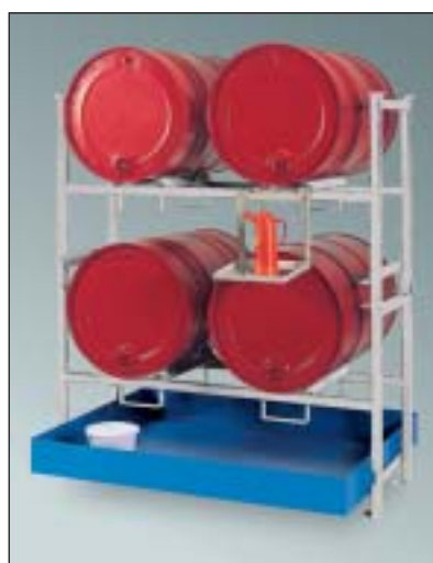
E2 with 2 x STR-2 stacking racks and can support