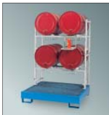
WSP-4-OS with 2 x STR-2 stacking racks and can support