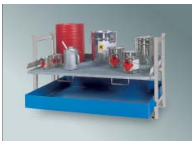
E2 with STR-G stacking rack

Simply safe, simply good. Four fork-lift tip openings mean that each rack can be safely picked up and put down with a fork-lift truck. Take off the empty drums, put on the new ones and return the rack to its position. All racks are anchored to prevent them falling over.