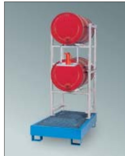
WSP-2-OS with 2 x STR-1 stacking racks and can support