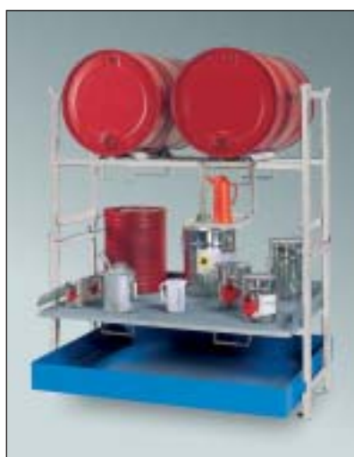
E2 with STR-2 + STR-G stacking racks and can support