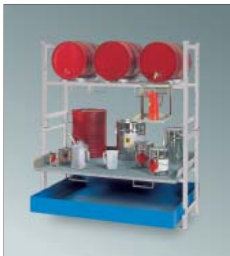
E2 with STR-3 + STR-G stacking racks and can support