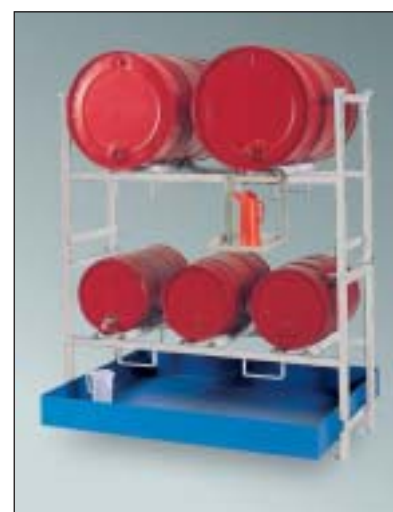
E2 with STR-2 + STR-3 stacking racks and can support