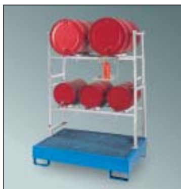
WSP-4-OS with STR-2+STR-3 stacking racks and can support