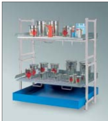
E2 with 2 x STR-G stacking racks