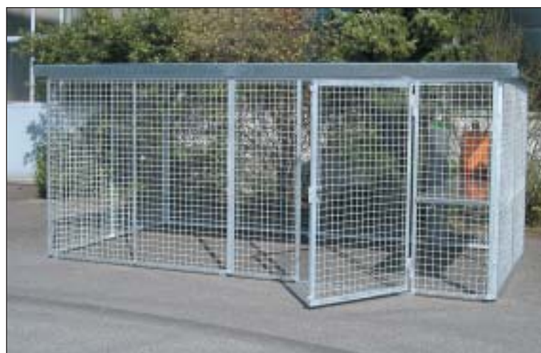
LB-4424, Article No. C27-1123-C, with optional shelf