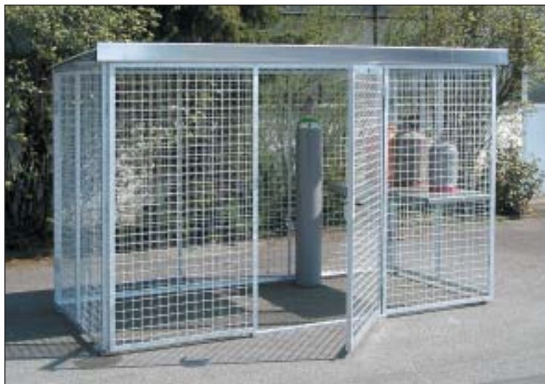
LB-3115, Article No. C27-1120-C, with optional shelf