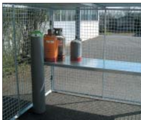
Optional shelf – price on request!