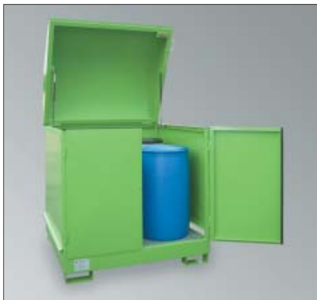
WSP-4SKKS/NB, custom-made version with natural ventilation (NB)