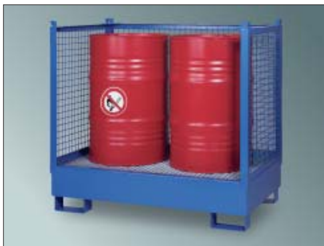
2SKS / Gitt, Article No. P21-2501-A