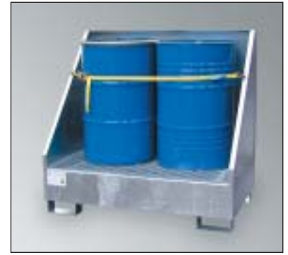
WSP-2SSS, Art. No. P21-1451-A, with optional fastening belt