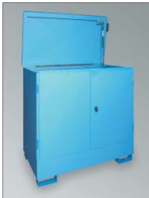
WSP-2SKKS, Article No. P21-2431-A