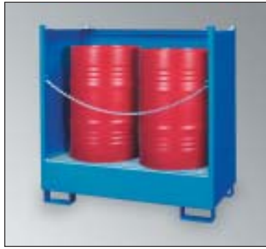
WSP-2SKS, Art. No. P21-2421-A, with optional security chain