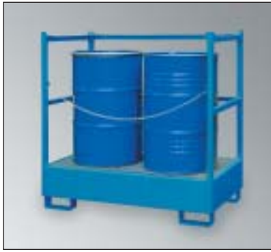
WSP-2STS, Art. No. P21-2411-A, with optional security chain