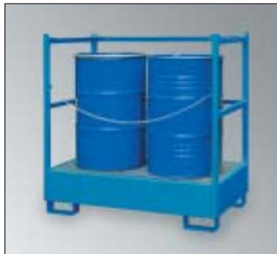
WSP-2STS, Art. No. P21-2411-A, with optional security chain