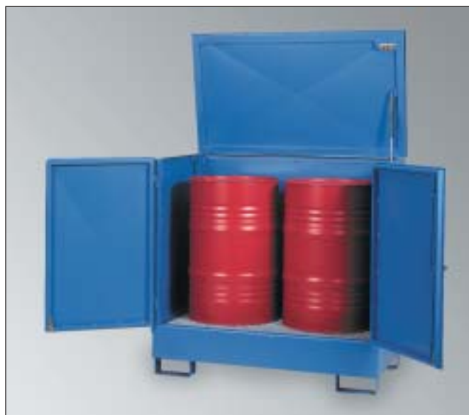
WSP-2SKKS, Article No. P21-2431-A