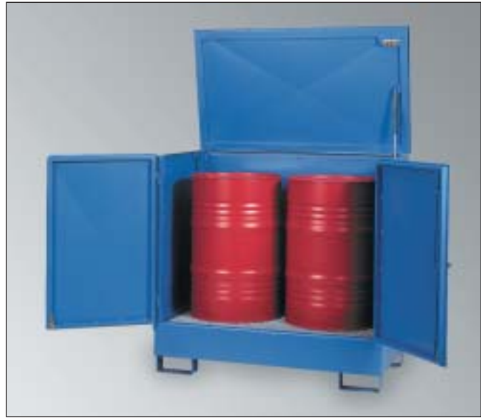
WSP-2SKKS, Article No. P21-2431-A