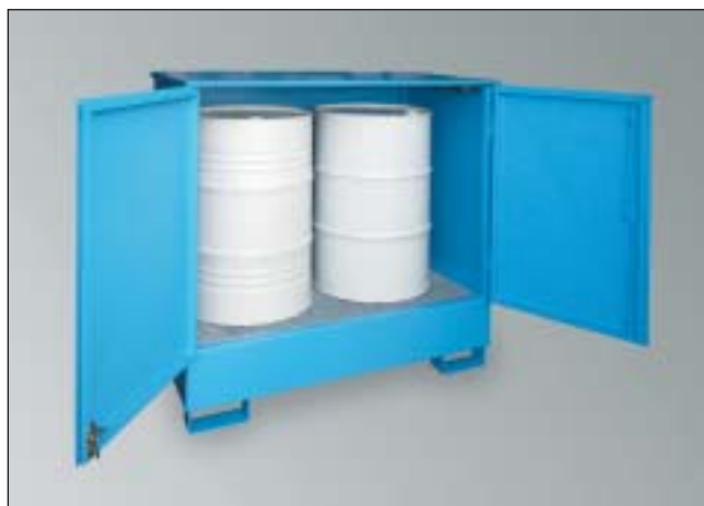
WSP-2SKKS, Article No. P21-2431-A