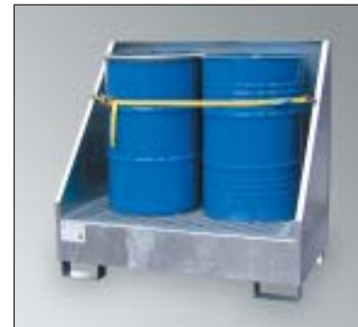
WSP-2SSS, Art. No. P21-1451-A, with optional fastening belt