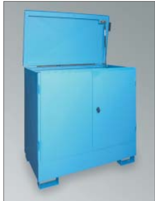
WSP-2SKKS, Article No. P21-2431-A