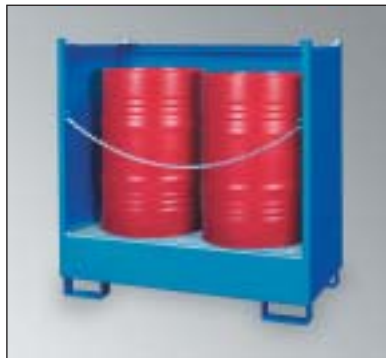
WSP-2SKS, Art. No. P21-2421-A, with optional security chain