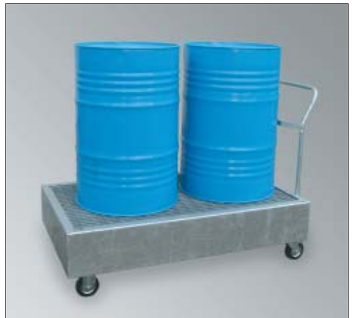
WSP-2OS/W, Art. No. P21-1407-A