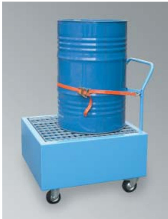
WSP-1OS/W, Art. No. P21-2406-A, with optional fastening belt

Suitable drum stands can be found on page 11!