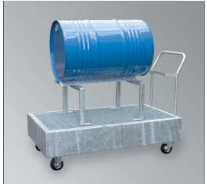
WSP-2OS/W, fire galvanized , Art. No. P21-1407-A, with optional drum stand