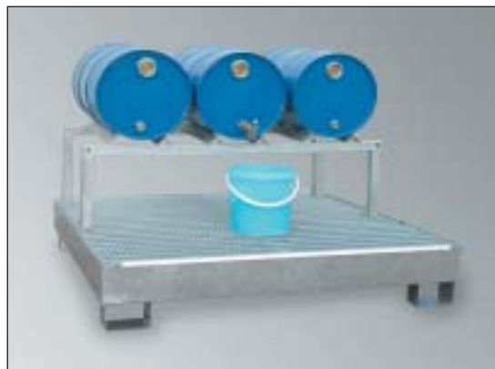
CW 4, Article No. P65-1003-A, with optional drum stand