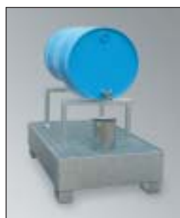
FB 1, Art. No. P21-1701-A