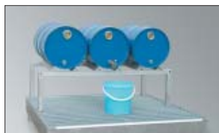
FB 3, Art. No. P21-1703-A