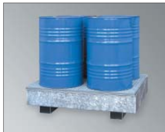
CW 4, fire galvanized , Article No. P65-1003-A