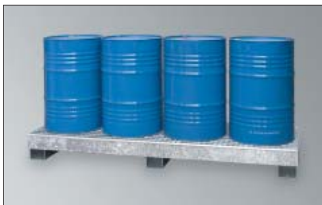
CW 4L, fire galvanized , Article No. P65-1004-A

Stainless steel collection troughs can be found on page 24!