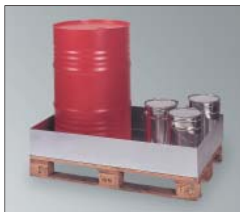
EW 2, without grid, Art. No. P66-1301-A