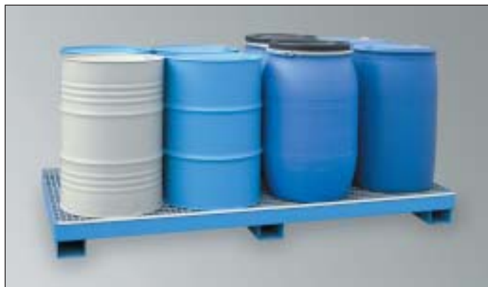
CW 8, Article No. P65-2005-A