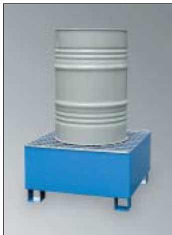
CW 1, Article No. P65-2001-A