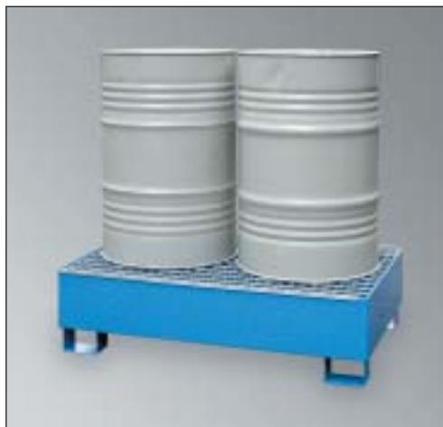
CW 2, Article No. P65-2002-A