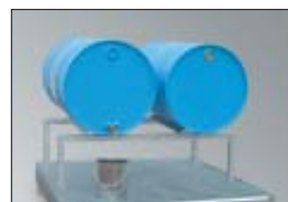
FB 2, Art. No. P21-1702-A