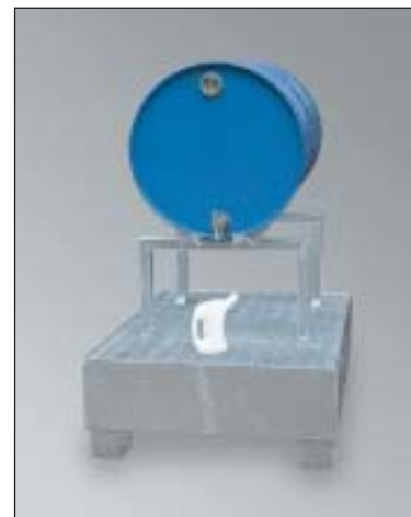
CW 2, fire galvanized , Art. No. P65-1002-A, with optional drum stand