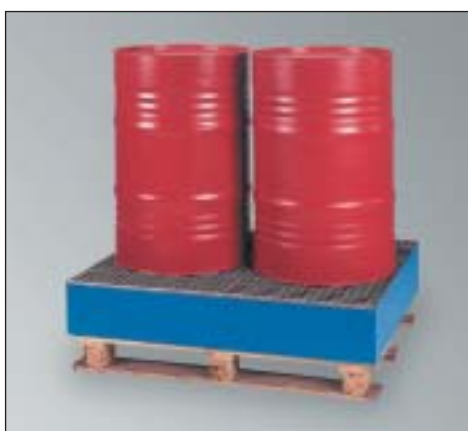
EW 2, with grid, Art. No. P66-2303-A