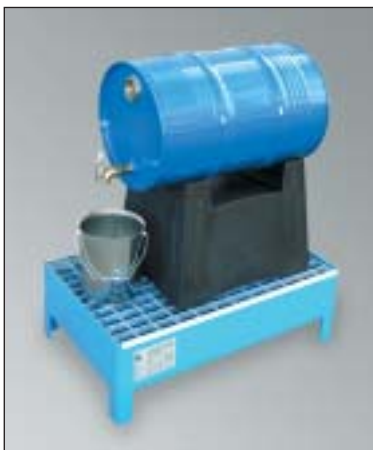
CW 60-2, Article No. P64-2051-A, with optional PE drum stand