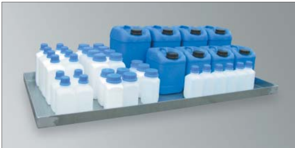
KGW 35, Article No. P25-1302-A

PE troughs for the storage of small containers can be found on p. 27!