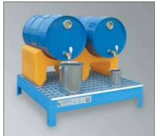
CW 60-4, Article No. P64-2052-A, with optional PE drum stand

PE drum stands can be found on page 33 !