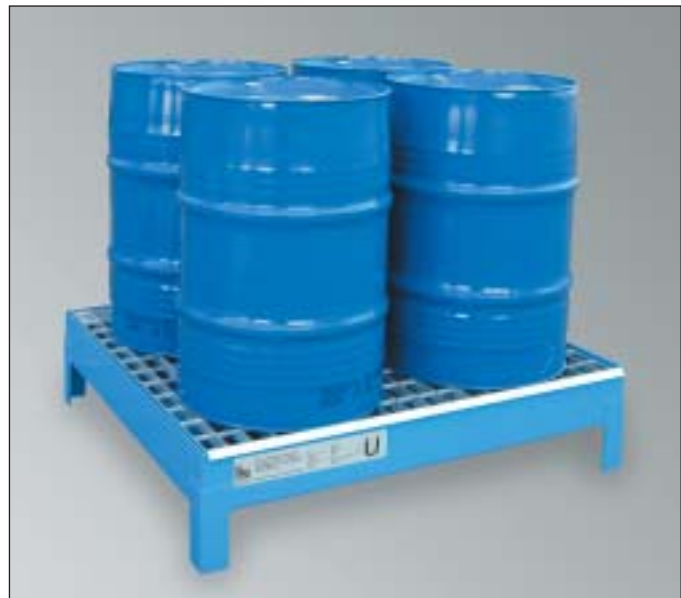
CW 60-4, Article No. P64-2052-A