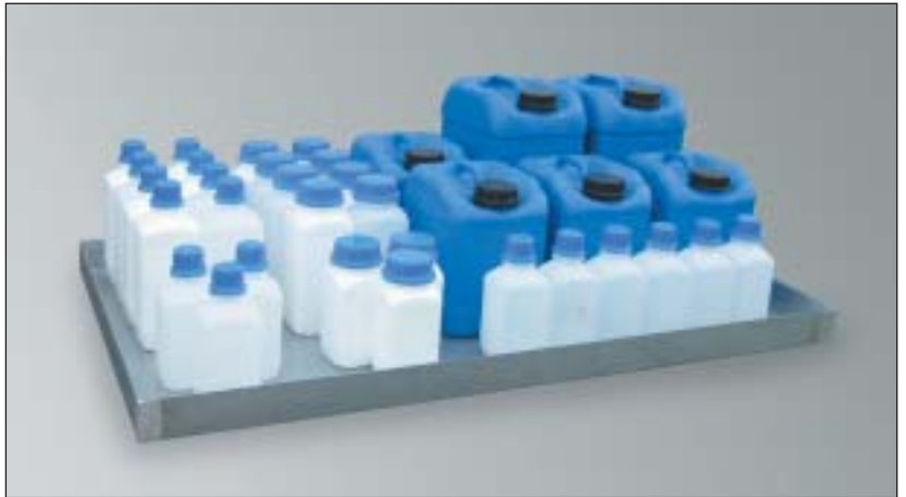
KGW 30, Article No. P25-1301-A