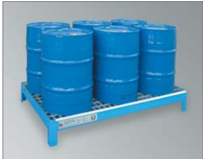
CW 60-6, Article No. P64-2053-A