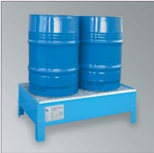
CW 60-2, Article No. P64-2051-A