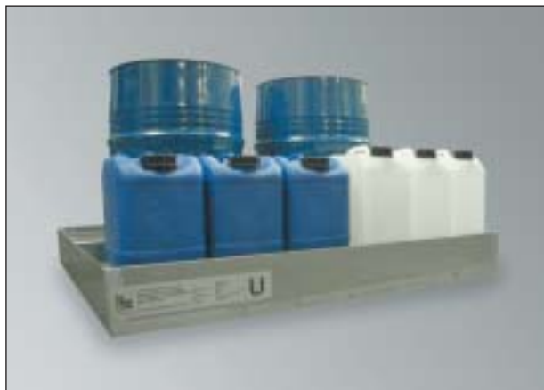
KGW 80, Article No. P25-1304-A