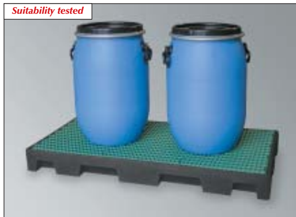
PE-100-EP1, Article No. P70-7008-A