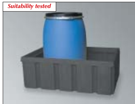
PE-100-EP9, Article No. P70-7016-A