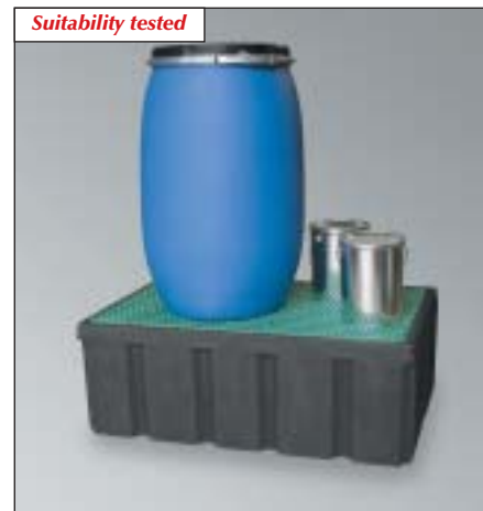
PE-100-EP9, Article No. P70-7017-A

General Constructional approval DIBt Berlin Z-40.22-360