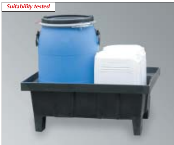
PE-100-EP10, Article No. P70-7045-A