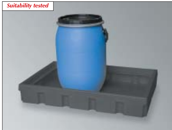
PE-100-EP3, Article No. P70-7006-A

General Constructional approval DIBt Berlin Z-40.22-360