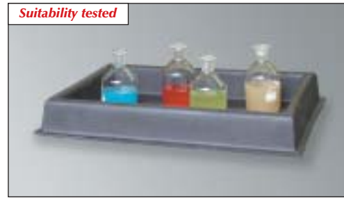
PE-100-EP7, Article No. P70-7004-A