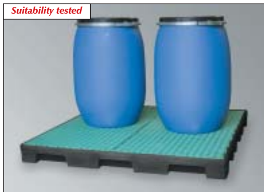
PE-100-EP2, Article No. P70-7018-A