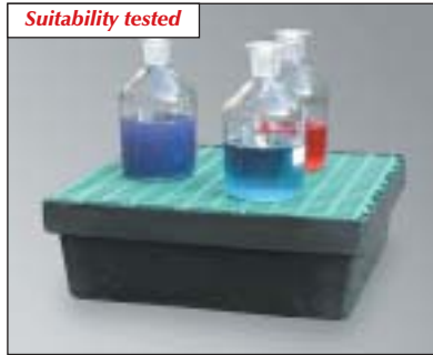
PE-100-EP4, Article No. P70-7001-A