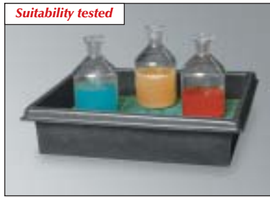
PE-100-EP6, Article No. P70-7003-A