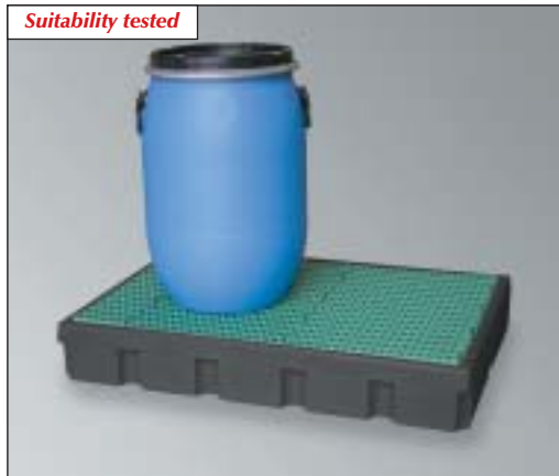
PE-100-EP3, Article No. P70-7007-A