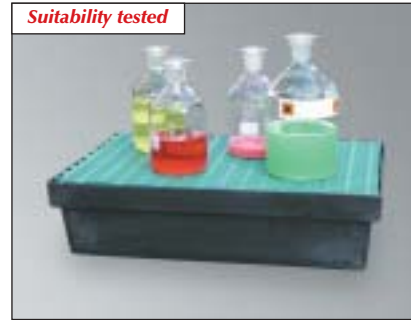
PE-100-EP5, Article No. P70-7002-A