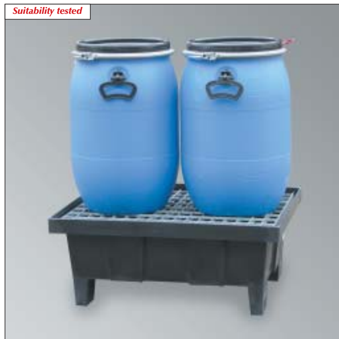
PE-100-EP10, Article No. P70-7046-A